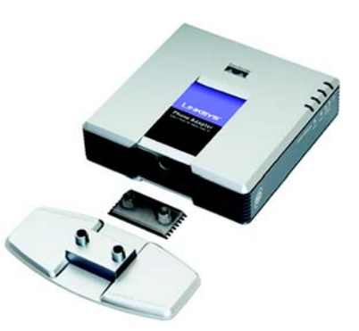
Figure 3-5: Attaching the Phone Adapter's Base

If you need to change any of the Phone Adapter's network settings, proceed to "Chapter 4: Using the Phone Adapter's Interactive Voice Response Menu."